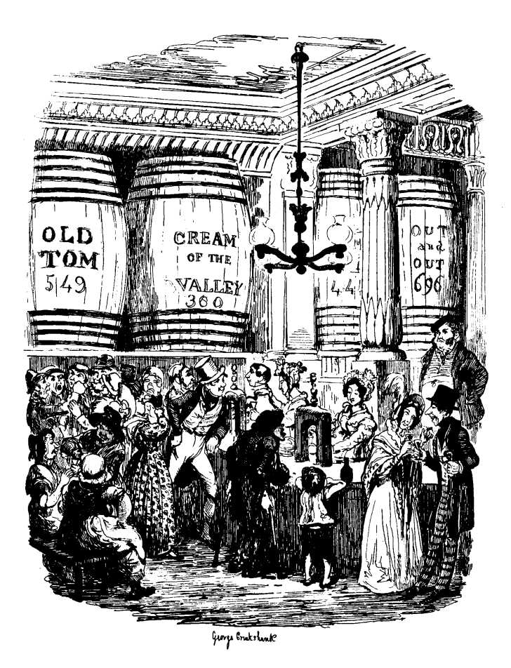
The Gin Shop

取られるのを防ぐために、その上には注意深く枝編み細工の蓋がしてある。 その後ろには大きなネックレスをしてけばけばしい服を着た二人の娘がい て、アルコールや「カクテル」を分配している。この店の雇われ店長が彼 女たちを手伝っている。この男は太った粗野なやつであるが、自分が抜け 目のない人物であることを見せてやろうとして、また、自分の薄茶色の頰 ひげが最大限に引き立つようにしようというつもりで、毛皮の帽子をかな り片方に傾けてかぶっているのだ。