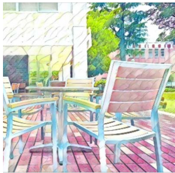
Seikei University Patio