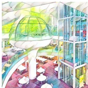
Seikei University Library